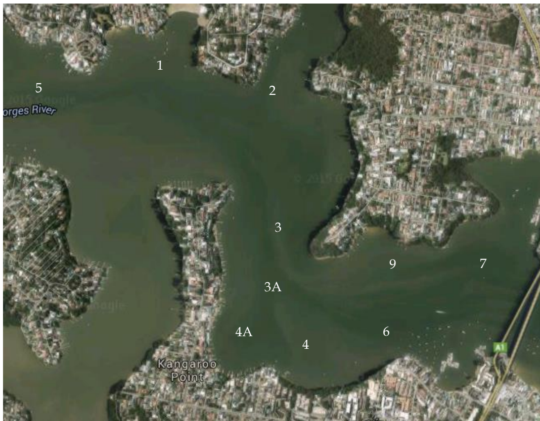
Buoy positions shown are approximate positions

A Gate may be used by the Race Committee and this is defined as; the line between the Port end Start / Finish Mark and the Flag Mast on the Committee Vessel at the starboard end.